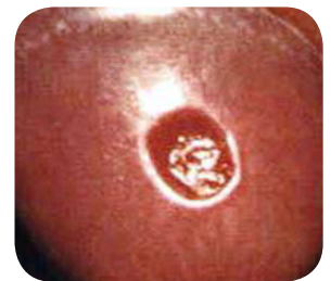
Example of a primary syphilis sore.

About 15% of people who have not been treated for syphilis develop late stage syphilis, which can appear 10–30 years after infection began. Symptoms of the late stage of syphilis include difficulty coordinating muscle movements, paralysis, numbness, gradual blindness, and dementia. In the late stages of syphilis, the disease damages the internal organs, including the brain, nerves, eyes, heart, blood vessels, liver, bones, and joints. This damage can result in death.