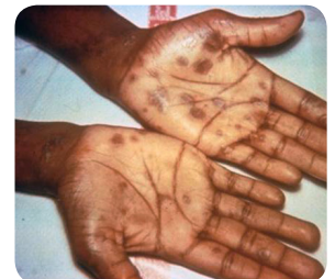
Examples of a secondary palmar rash (above) and a generalized body rash (below)